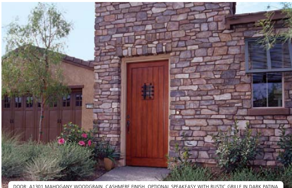
DOOR: A1301 MAHOAGANY WOODGRAIN, CASHMERE FINISH, OPTIONAL SPEAKEASY WITH RUSTIC GRILLE IN DARK PATINA